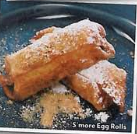
S'more Egg Rolls